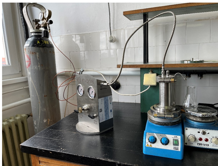
Figure 4. METcell® dead-end filtration unit installed at the TFNS laboratory labeled with TwiNSol-CECs sticker

Funded by the European Union. Views and opinions expressed are however those of the author(s) only and do not necessarily reflect those of the European Union or EU executive agency. Neither the European Union nor the granting authority can be held responsible for them.