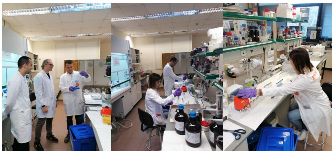
Preparation of large series of surface water samples for subsequent targeted and suspect screening analysis of PFSA and PhACs at CSIC, IDAEA, Barcelona