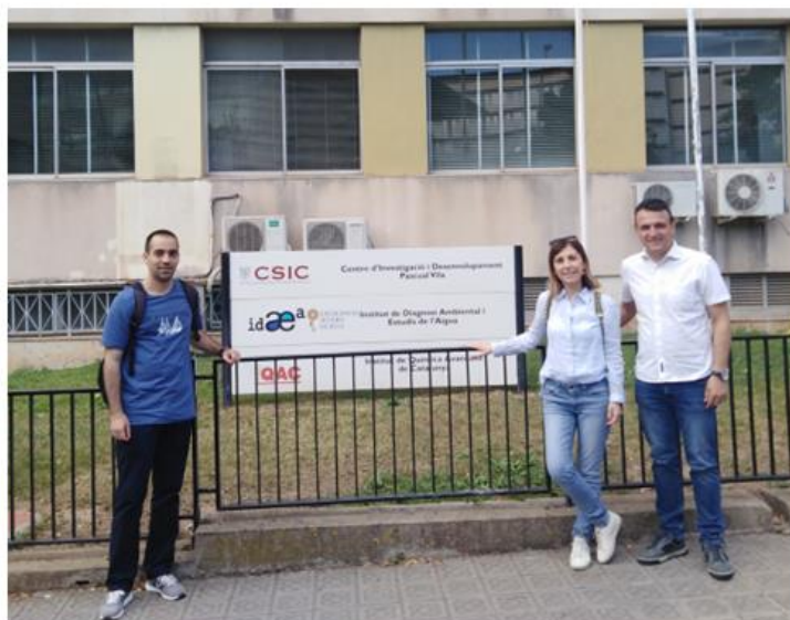
Visit of TFNS team members to CSIC, IDAEA, Barcelona, during 4th onsite TwiNSol-CECs Training