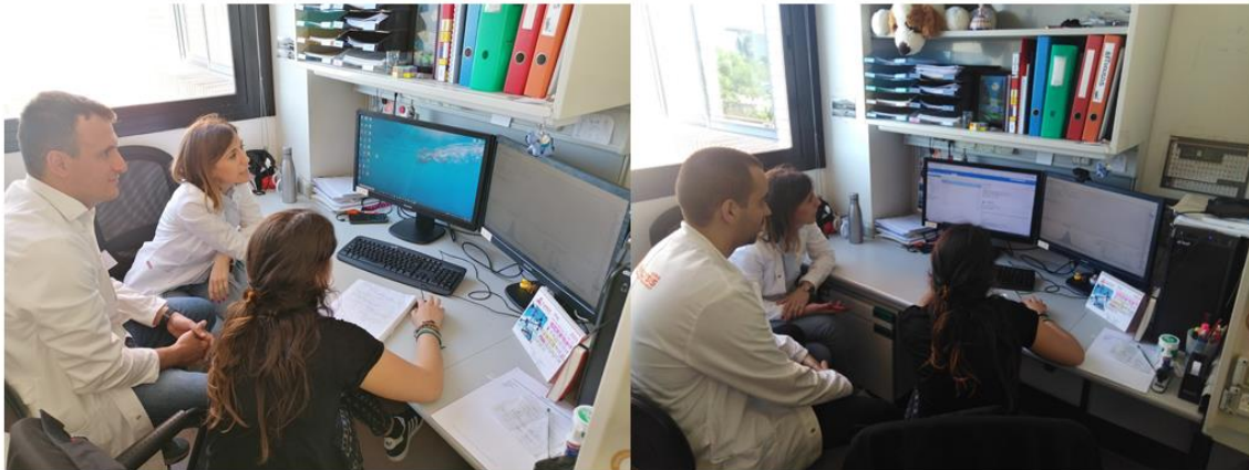
Data processing by Xcalibur software and their analysis for target screening of PhACs and PFASs at CSIC, IDAEA, Barcelona