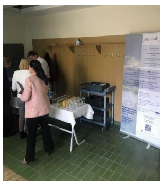
Coffee/refreshment break during Project Kick-off meeting