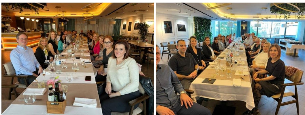
Official lunch for Project team members